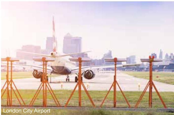
London City Airport

In the case of London City Airport, there was much debate around the table as to which community should be respected and to what degree. Although the financial benefits to the immediate community are few, there are four million people who pass through the airport every year. Should we also consider their interests, the interests of international students and tourists, or the global responsibility that London now has?