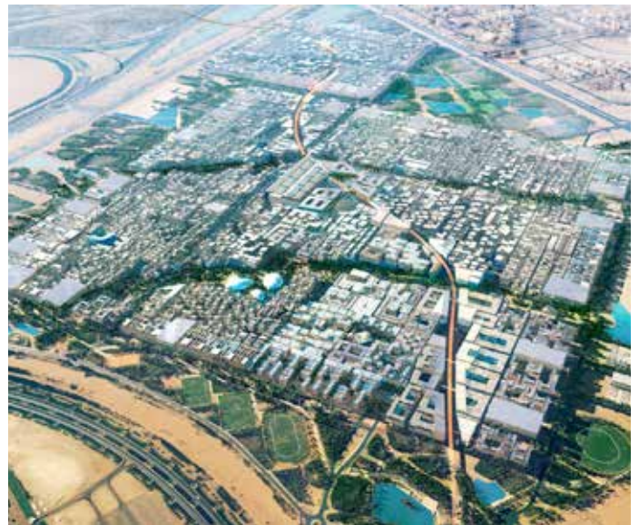
Masdar City in Abu Dhabi, designed by Foster and Partners